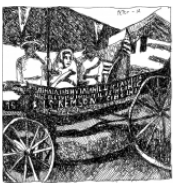
Highlights from the Suffrage Wagon News Channel

It's what we've all been waiting for. Through May 2012 the suffrage campaign wagon is on exhibit at the Hall of Governors in Albany, NY. Find out more about this exciting development. And stay tuned for reports back from the state capitol this spring.