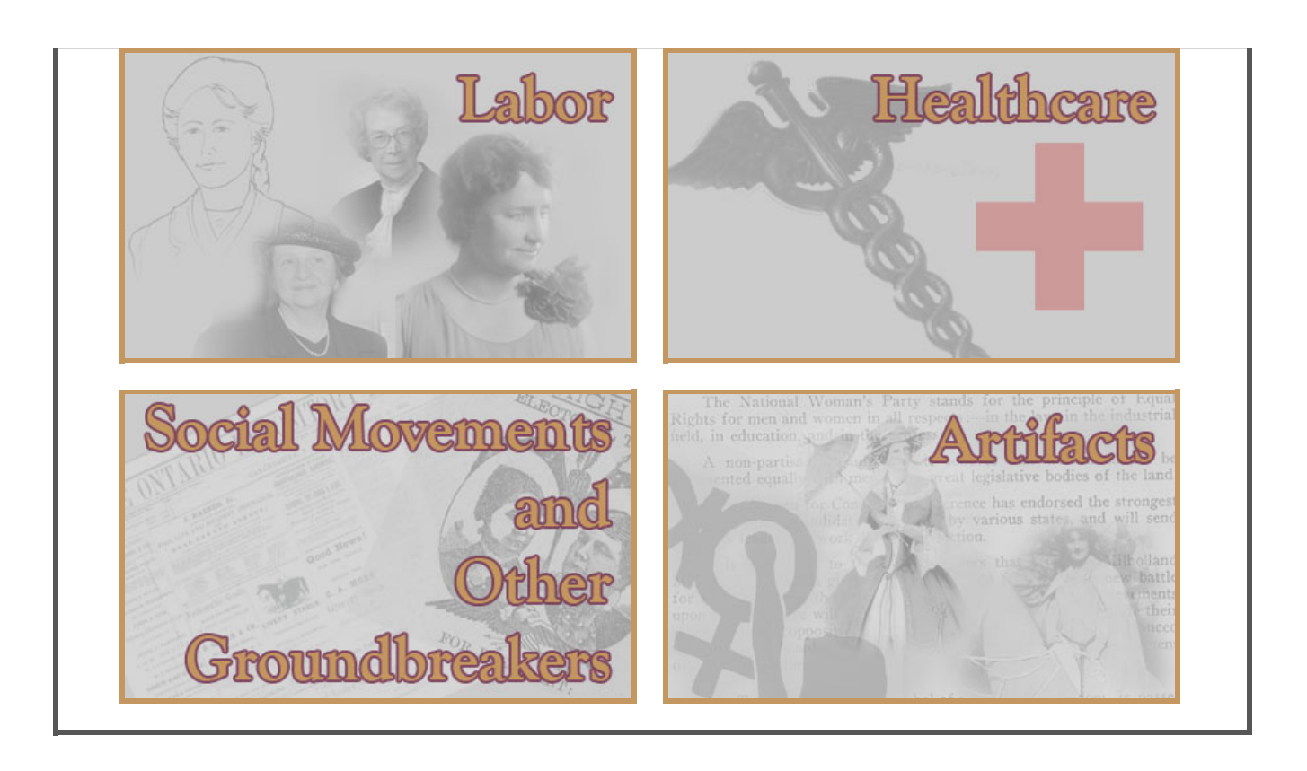
Privacy Policy | Accessibility | Contact